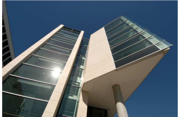
c) Stadthalle, 78224 Singen (Hohentwiel), Am Schlossgarten