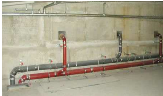
c) Silent BD20 - plastic drainage system, low-noise (manufacturer Geberit)