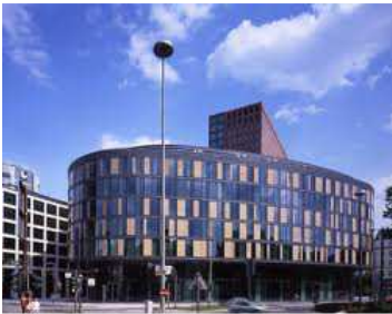
a) Oval am Beseler Platz, 60589 Frankfurt am Main