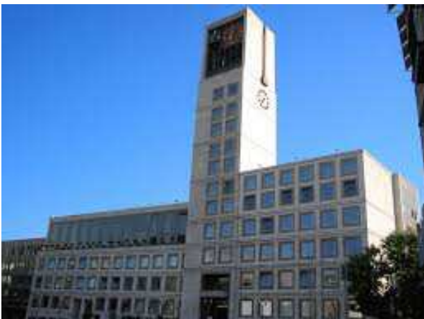
a) Rathaus der Landeshauptstadt Stuttgart, 70171 Stuttgart