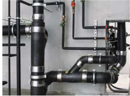
c) AL-Pex systems - aluminum-plastic composite crimped system (various manufactures)